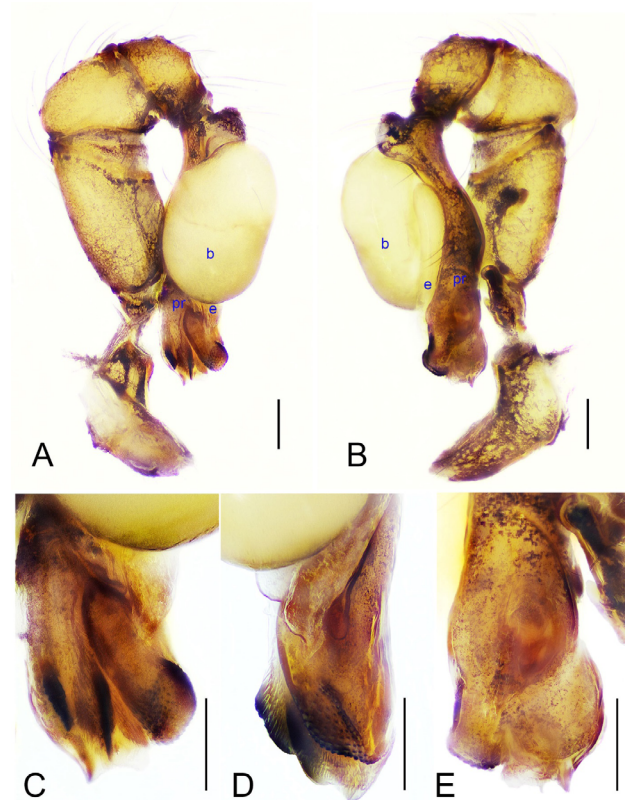
Fig. 1. Khorata danxia sp. nov., holotype male. A, Pedipalp, prolateral view; B, Ditto, retrolateral view; C, Distal part of procurus, prrolateral view; D, Ditto retrolateral view; E, Ditto, ventral view. b, bulb; e, embolus; pr, procurus. Scale bars: 0.1 mm.

Paratype: 1 ♀ (HNU, Phol-Khor-0001-002), CHINA—Guangdong Province, same data as holotype.