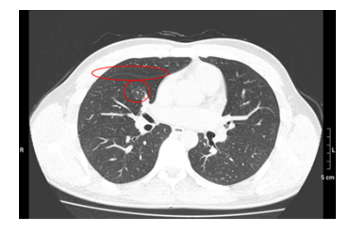
Fig. 1. HRCT of second day of infection. It shows haze area in right perihilar region and minimal apical interlobular septal thickening.

The uniqueness of the study case is the major strength of this work. In earlier studies no such case had been reported. Here we see a case which qualifies that there is no final word in scientific investigation. RT-PCR showed consistent negative results whereas HRCT showed the true prognosis of the disease. Thus, the objective of providing a quick and sure relief for the patient was ensured. Sample collection, transport, storage and processing of the RT-PCR sample could inhibit successful detection of the virus but in the present case study repeated tests confirmed the integrity of the results. Sometimes unknown factors could hinder the process of diagnosis of disease that may include virus variant formation due to high spread rate among the population.