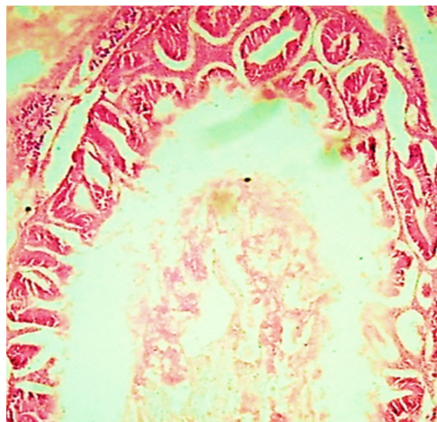
Fig. 3. Cross section of intestine of L. rohita fed with commercial feed showing normal appearance of serosa layers and villi (100X).