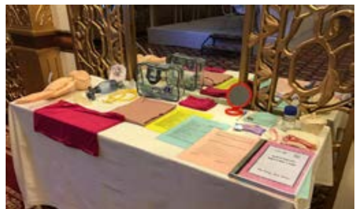
Figure 1: KMC KIT

Kangaroo Mother Care promotes maternal bonding, confidence and increases milk production resulting in successful breast feeding. (7) If mother is unable to carry baby due to section or any other medical problem, father or other family members can also give Kangaroo Care. (8) Kangaroo Mother Care prevents hypothermia and, normalizes heart rate and respiratory rate resulting in decreased nosocomial and respiratory tract infections. (9) Weight gain is more in KMC babies with improvement in sleep pattern and relief for colic. (10), (11)