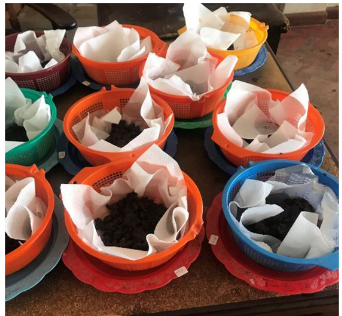
Figure 1: Sample assemblage of nematodes from citrus regions of Kenya (2018-2019).

Site soil type was identified as major factor to PPNs abundance in relation to chemical and physical conditions of the rhizosphere. This would lead to interpretation of the PPNs preference and abundance on citrus among the sample sites. Similarly, wet and dry field conditions were assumed to influence population density of PPNs thus mean area rainfall amounts were used to correlate to density population and nematode species of the sample sites. In addition, the site mean temperature was also used in the correlation to determine species and population density of PPNs occurrence and abundance.