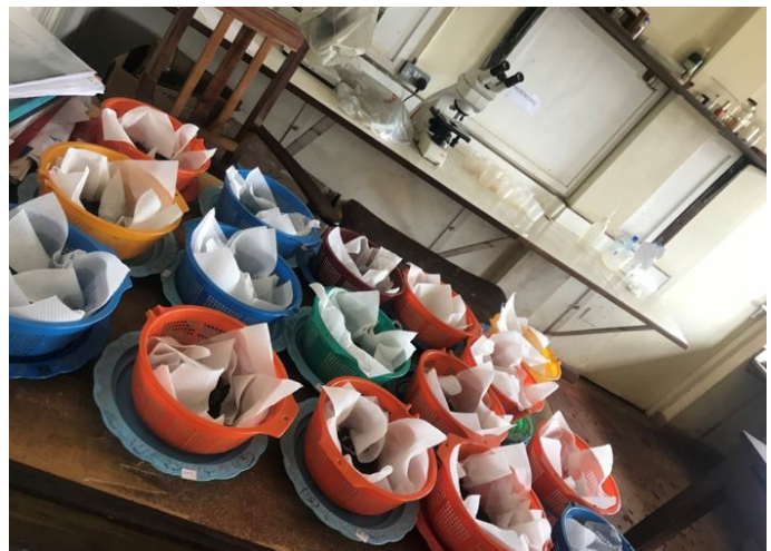
Figure 2: Sample soil processing and microscopic identification (KALRO Kabete 2018-19).