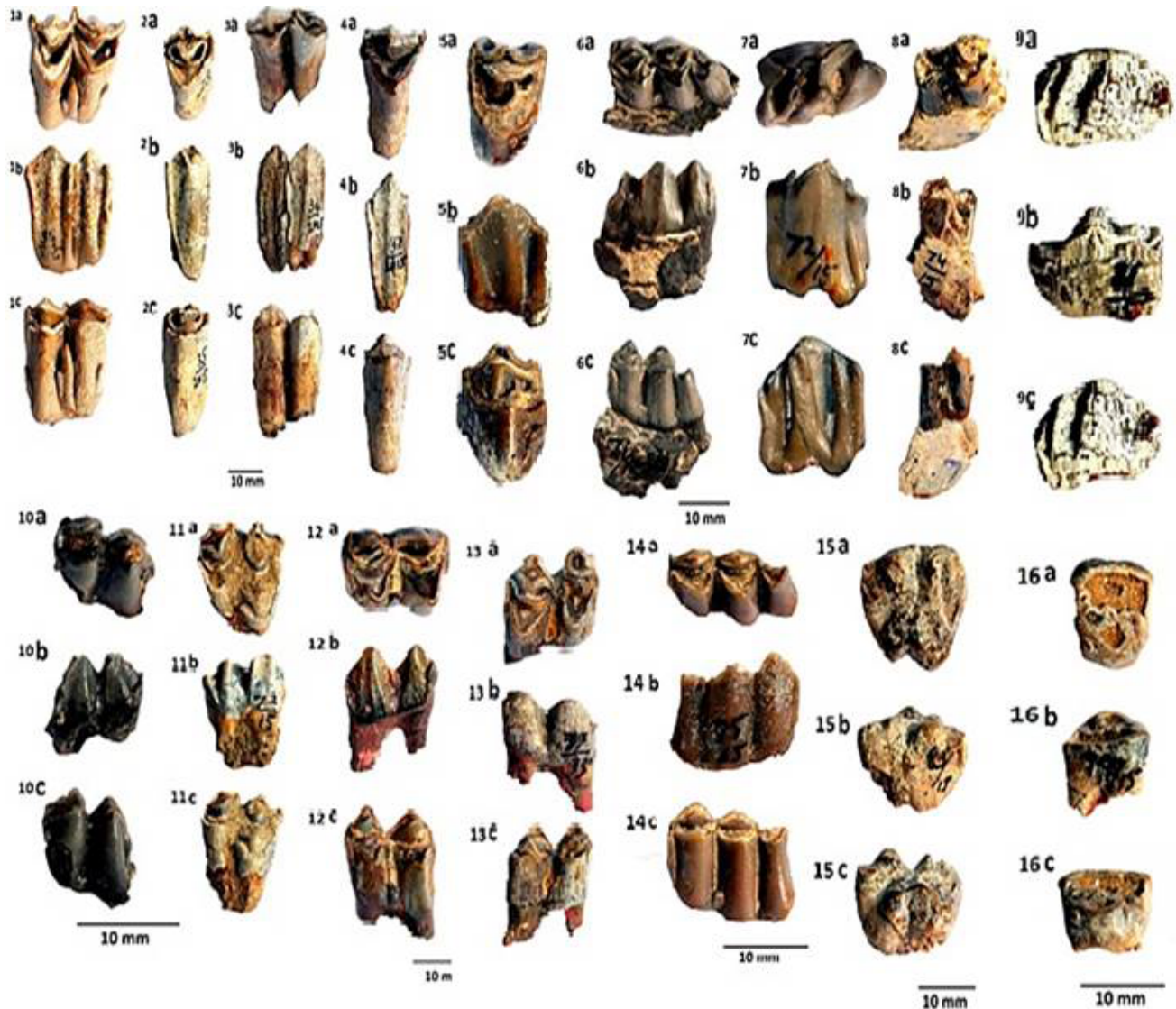
Fig. 2. Salenoportax vexillarius : PC-GCUF 34/2015 (1), Upper left second molar; PC-GCUF 35/2015 (2), left upper interior part of first molar; PC-GCUF 36/15 (3), lower right first molar; PC-GCUF 37/2015 (4), upper posterior part of first left molar. Pachyportax latidens : PC-GCUF 39/2015 (5), right upper third premolar; PC-GCUF 71/15 (6), lower right third molar; PC-GCUF 72/15 (7), fourth right lower premolar; PC-GCUF 74/15 (8), left second lower molar. Dorcatherium minus : PC-GCUF 81/15 (9), lower right fourth premolar; PC-GCUF 82/15 (10), lower right second molar. Dorcatherium majus : PC-GCUF 73/15 (11), right second upper molar; PC-GCUF 76/15 (12), left first lower molar; PC-GCUF 77/15 (13), left second lower molar. Gazella lydekkeri : PC-GCUF 75/15 (14), lower left third molar. Hippopotamodon sivalense : PC-GCUF 83/15 (15), Right lower fourth premolar. Propotamochoerus hysudricus : PC-GCUF 79/15 (16), right upper fourth premolar. Views: a-occlusal, b-lingual, c-buccal.

characterized by the isolation of protocone, the anterior median rib and the presence of stylids. This specimen shows morphologically similarities with the PUPC 05/03. In both specimens the tooth is narrow crowned and hypsodont. The enamel is uniformly thick and this is finely rugose in all specimens. In both specimens a deep transverse valley is present between the hypconid and