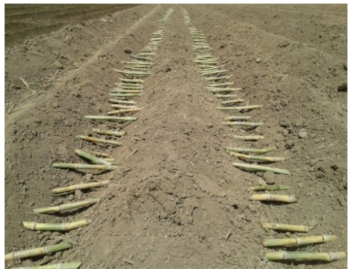
Figure 3: Single sett (across furrow).

was laid out under split plot design (randomizing the planting methods in main plots and NPK levels in sub plots) having three replications. The crop was planted on 22 nd September 2016 and 25 th September 2017. The field area was well managed prior to planting. The planting methods included single sett (parallel to furrow), double sett (parallel to furrow), single sett (across the furrow), while NPK levels comprised of NPK: 166-084-165 kg ha -1 (25% <recommended), 225-112-220 kg ha -1 (recommended) and 281-140-275 kg ha -1 (25% >recommended). The recommended NPK fertilizers were applied in the form of Urea, DAP (diammonium phosphate) and SOP (sulphate of potash). All P and K, and 1/3 rd of N were applied at the time of planting. The remaining two splits of N were applied at 1 st earthing-up (3½ months after sowing) on 7 th January, 2017 and 9 th January 2018. In the same way second, spilt dose was applied in next earthing-up (about 45 days after initial earthing up) on 23 rd February, 2017 and 24 th February 2018.