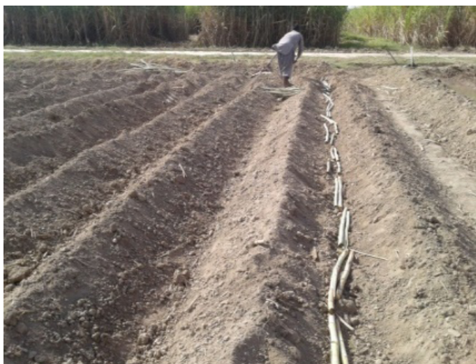
Figure 2: Double sett (parallel to furrow).