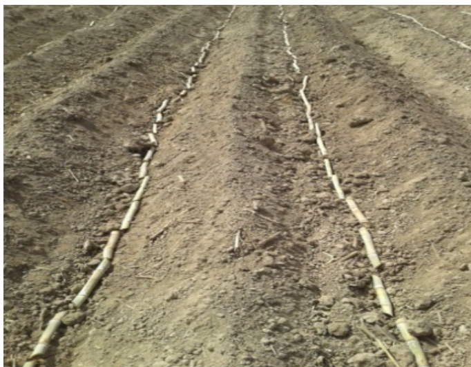
Figure 1: Single sett (parallel to furrow).

The agronomic and physiological observations were recorded for parameters of economic importance such as seed germination (%), crop growth rate (g m -2