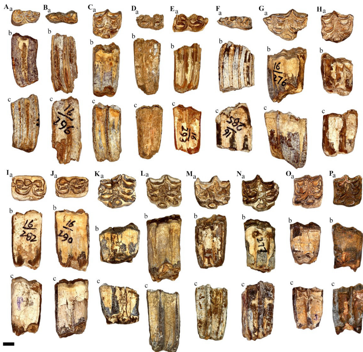
Fig. 2. The representative cheek teeth of the Siwalik hipparionine from the Middle Siwalik of Attock, Punjab, Pakistan. Hipparion sp. small: A , PUPC 16/283, l m3; B , PUPC 16/296, rm3. Cormohipparion sp.; C , PUPC 16/351, rM3; D , PUPC 16/281, rm1; E , PUPC 16/293, lm2; F , PUPC 16/285, rm3. Sivalhippus nagriensis ; G , PUPC 16/276, lP2; H , PUPC 16/273, rM1; I , PUPC 16/282, rp3; J , PUPC 16/290, lp4. Sivalhippus theobaldi ; K , PUPC 16/275, lP2; L , PUPC 16/272, rP4; M , PUPC 16/288, lP4; N , PUPC 16/277, rM1; O , PUPC 16/274, rM2; P , PUPC 16/294, rM3. Scale bar 10mm.

*The studied specimens. Referred data are taken from Colbert (1935), Ghaffar (2005), Khan et al. , (2012) and Wolf et al. (2013).