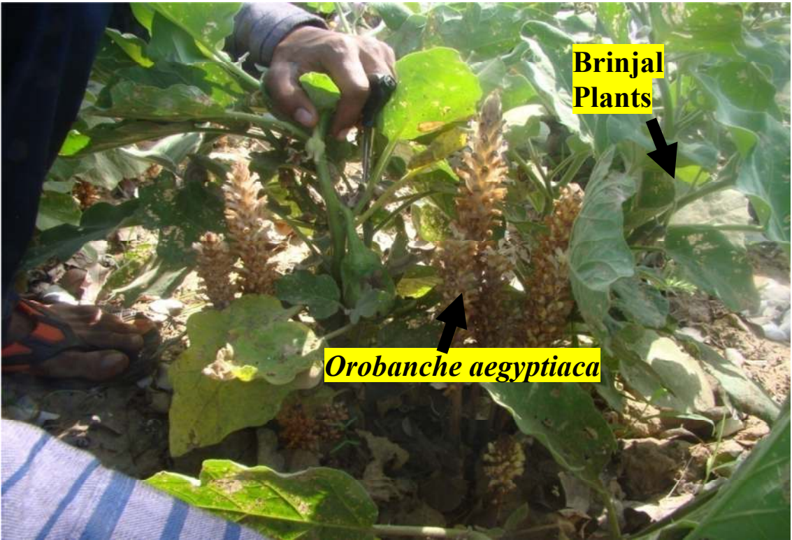
Figure 1. Brinjal field infested with Orobanche aegyptiaca.