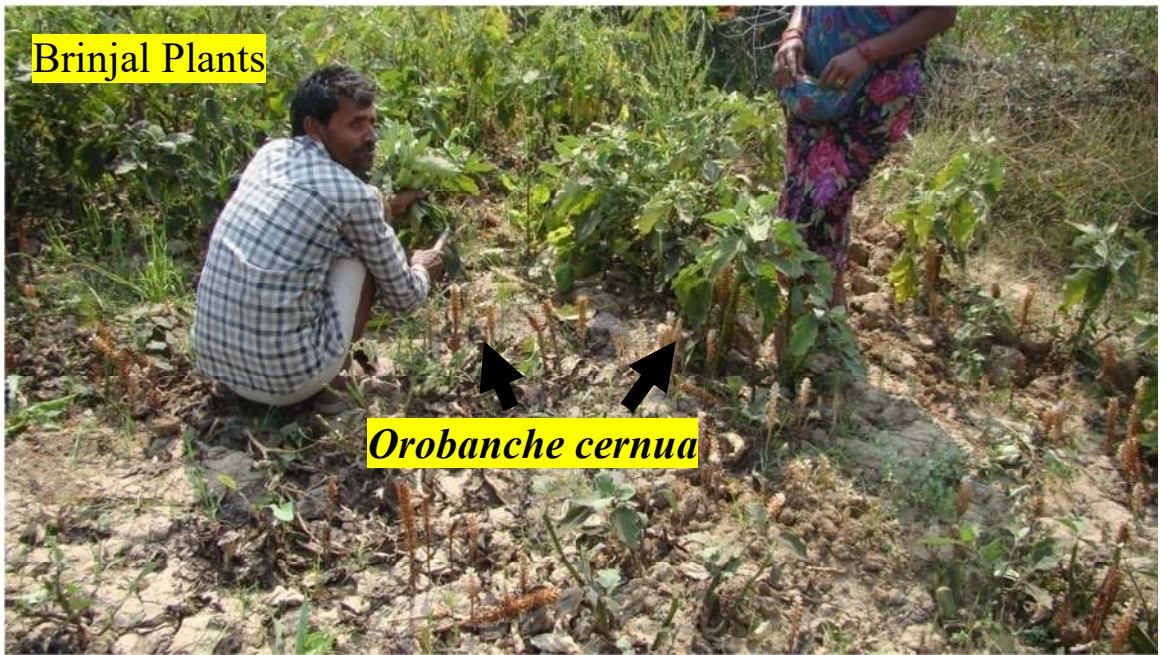
Figure 2. Brinjal field infested with Orobanche cernua.