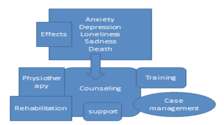
Figure 2: Diagrammatic Model for representing effects and controlling of drug addiction.

Taken together, these traits reveal a deficit in the cognitive processing of emotions. Increased drug use in teenagers is also associated with difficulties in identifying and expressing emotions, and among young substance abusers, alexithymia prevalence is reported to vary from 30 to 43.9 percent in those aged 15 to 24 - observed at higher levels than in the general population (Parolin et al. , 2017).