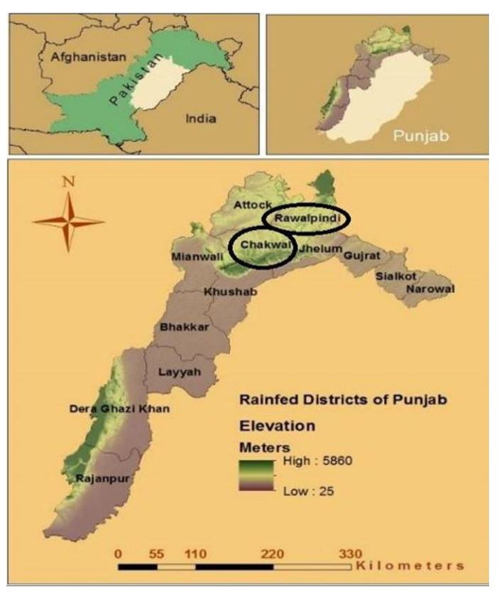
Map of study area

Concerning the problems of the livestock sector in Pakistan, there are plenty of issues associated with economic, social, cultural and most importantly biological ones (Riasat et al. , 2014; Akram et al. , 2018). There are many other findings, according to their reports this domain is facing a variety of issues, undermining the real strength and progress of this potential bearing aspect of agriculture in the country. These problems are proving a meaningful hurdle in achieving the sustainability goals when it comes to the agricultural economy as a whole or just the rural development in the country.