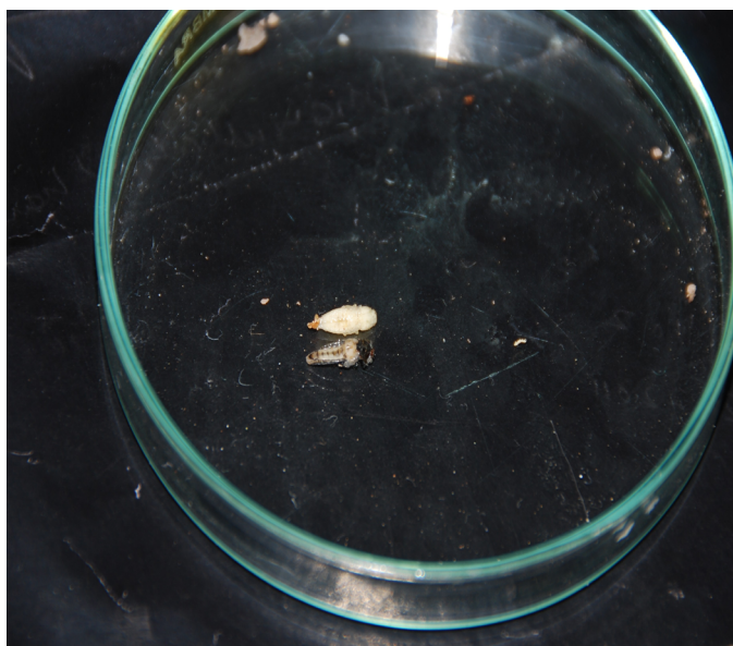
Figure 3: Pupa