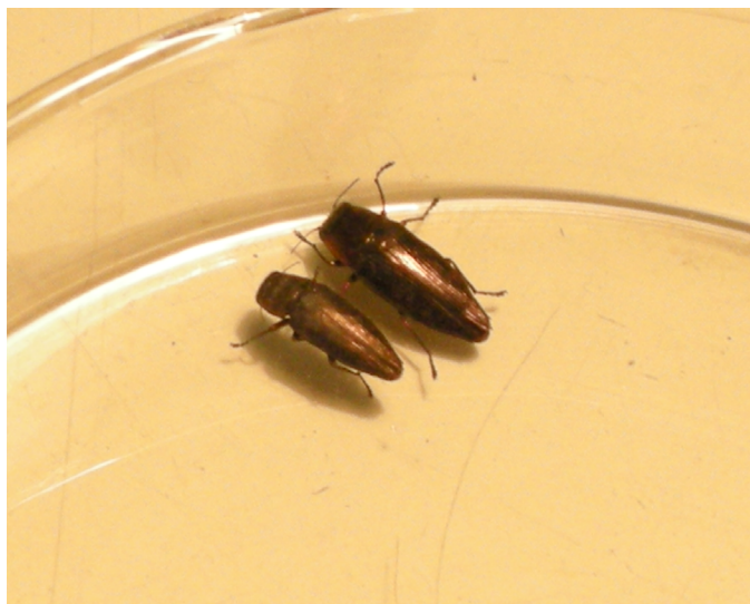
Figure 1: Adult of Sphenoptera dadkhani (Oben.)