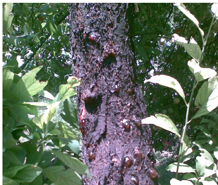
Figure 6: Gum spots