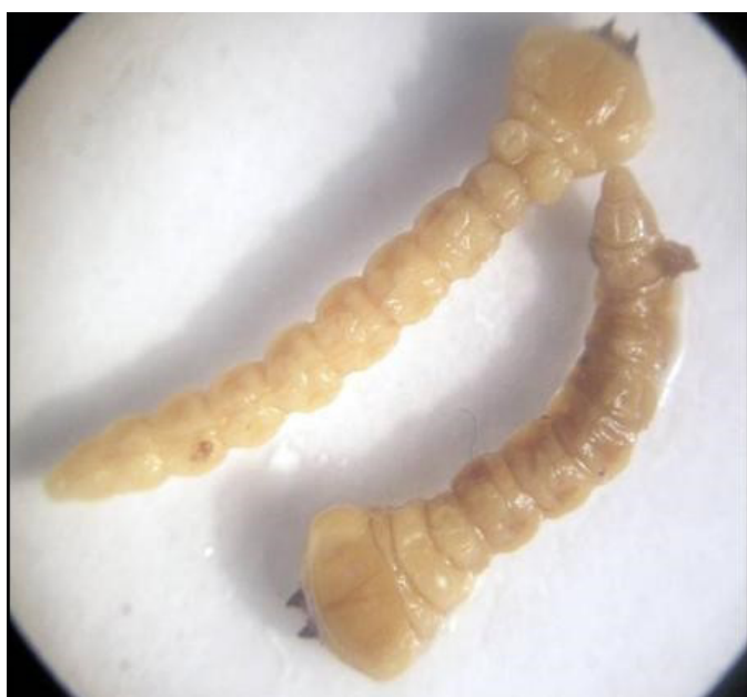
Figure 2: Larva (Grub)