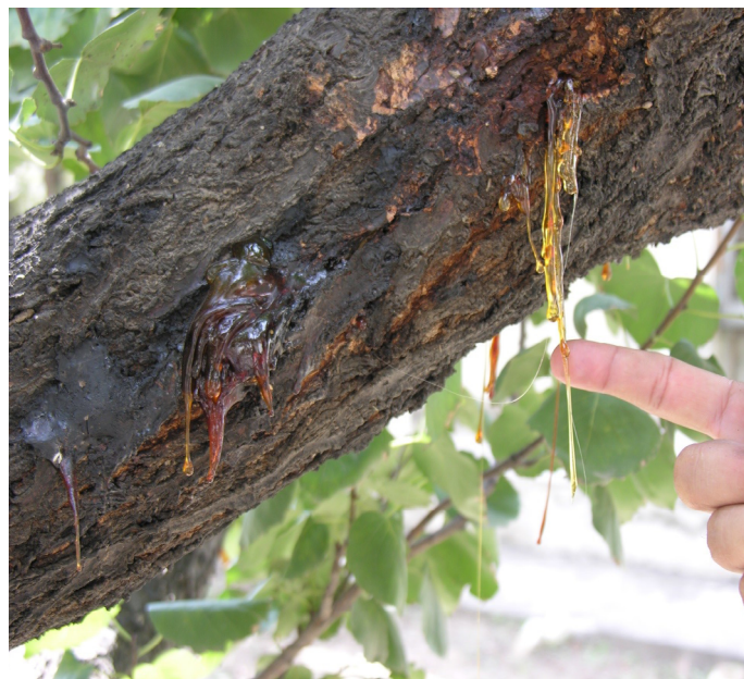
Figure 5: Exudation of gum