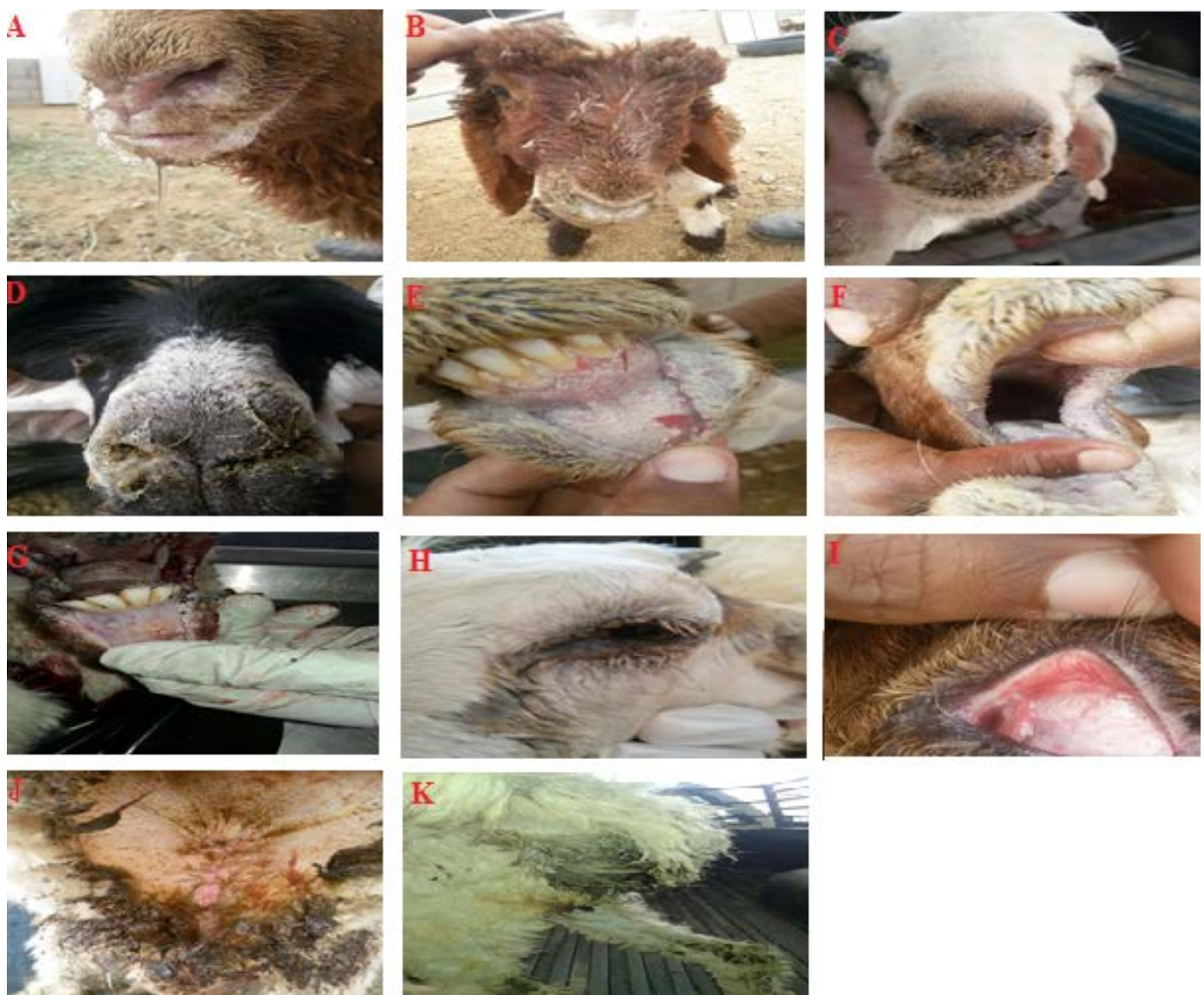
Figure 2: Infected animals showed A-B. Salivation C-D. dried mucopurulent discharges E-F. erosions on lips, gum, soft and hard palates, tongue and cheeks G. white nodule on gum H. ocular discharges I. reddened eye J-K. watery to bloody diarrhea.

Six ovine sera (30%) were positive for anti-NP antibodies while goats were negative.