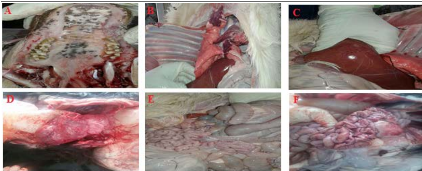
Figure 3: Postmortem examination of infected animals revealed A. False membranes; erosions on the soft and hard palates. Hemorrhage in B-C. lung (evidence of pneumonia) and liver D. Abomasum E-F. small & large intestine