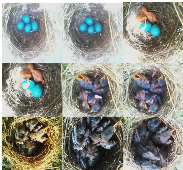
Fig. 2. Different breeding stages of Jungle Babbler ( Turdiodes striata Dumont, 1923).