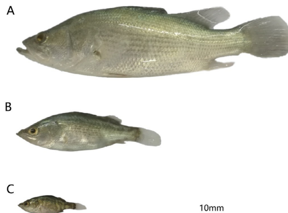
Fig. 1. Different body length grades of barramundi (A, long grade; B, medium grade; C, short grade).

frozen in liquid nitrogen and then preserved in -80 °C until use.