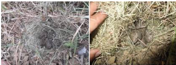
Fig. 3. Nests of Lemniscomys barbarus (Mekla, Great Kabylia, Algeria, June 2017).

Few juveniles were trapped for any species except for M. spretus with 11 juveniles over 26 specimens. Juveniles of L. barbarus were trapped in June and July (Fig. 1B) and sub-adults mainly from August to December (Fig. 1C), suggesting a winter break of reproduction. At the opposite, juveniles of M. spretus were trapped from