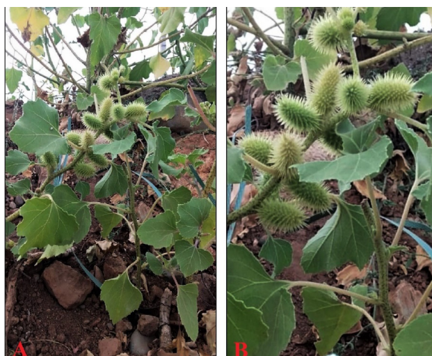
Fig. 1. Leaves and seeds of Xanthium strumarium (cocklebur) plant.

have demonstrated the toxic effects and mechanisms of X. strumarium extracts and monomers. Different doses of X. strumarium fruit extract were administered orally or intraperitoneally to rats and mice, and some biochemical parameters in serum were examined; of these animals, liver weight increased as a sign of liver damage, serum Alanine aminotransferase (ALT), aspartate aminotransferase (AST), alkaline phosphatase (ALP), activity and total bilirubin (TBIL) levels increased and the damage became more severe as the dose increased (Xue et al. , 2014).