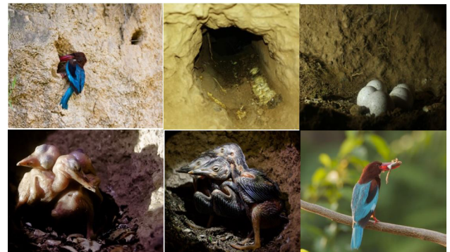
Fig. 2. Nesting tunnel, clutch size, chicks in the tunnel and hunting activities of the white-throated kingfisher.