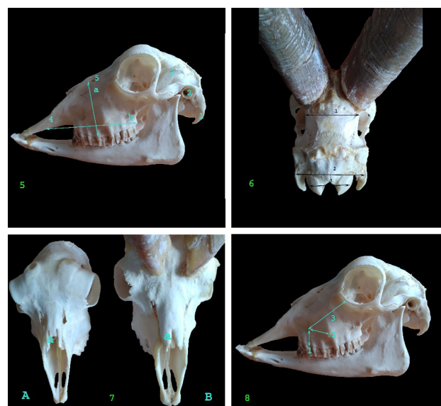
Fig. 2. Measurement of skull lateral view of Gurcu goats. 5: a, Width of maxilla; b, Length of maxilla; 1, paracondylar process; 2, meatus acusticus externus; 3, coronoid process; 4, nasal bone; 5, nasolacrimal fissur; 6: Measurement of skull occipital view of Gurcu goats; 1, Width of parietal; 2, Interparacondylar width; 3, Intercondylar width; 7: Dorsal view of skull in female and male Gurcu goats; A, Female Gurcu goat; B, Male Gurcu goat; a, Septal process; 8: 1, Distance between foramen infraorbital and premolar tooth; 2, The distance between foramen infraorbitale and tuber faciale; 3, The distance between foramen infraorbitale and orbita.