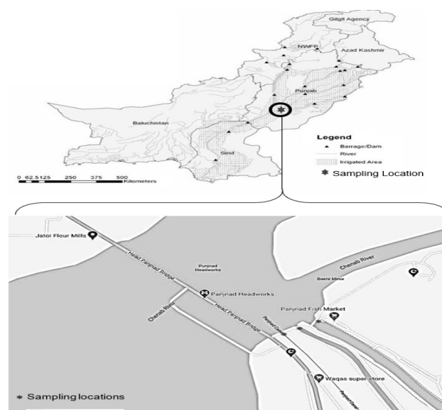
Fig. 1. Map showing the location of sampling areas.

Sample collection was carried out at different locations of Panjnad Headworks targeted as Abu Dhabi, Abbasia and Panjnad Canal as shown in Figure 1. Fish samples were collected randomly at daytime using different types of available nets such as common fish trap nets, drag nets, cast nets, bait hooks and hand nets. Sampling was done for the duration of 12 months starting from February 2020 to January 2021.