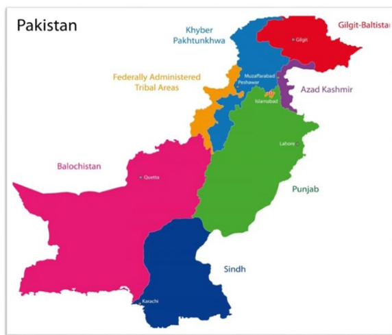
Figure 3: The Pakistan cotton production