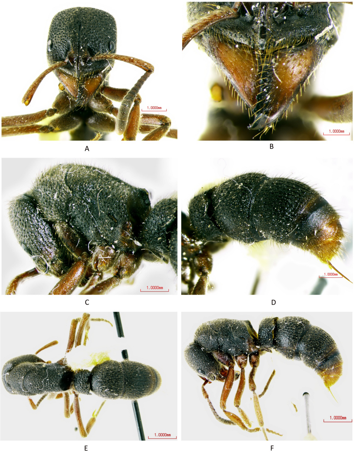
Figure 2: A-F. Pseudoneoponera rufipes , sp. n., major worker; A) Head, full face view; B) Mandibles; C) Propodeum; D) Gaster, dorsal view; E) body, dorsal view; F) Body, lateral view.