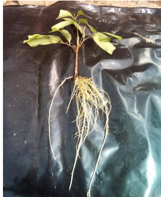
Figure 2: Remarkable interaction of 5000 ppm IBA with 'Gola' hardwood stem cutting for maximum, lengthy and heavier roots.

(from 1000-5000 ppm), compared to 'China' at the same concentrations ( 10 \pm 0.4 to 35 \pm 0.81\% ). In general, rooting percentage, survival rate, root number, length and weight were considerably improved by increasing the concentration of IBA up to 5000 ppm and then decreased by additional IBA concentration. All roots observed were of cream color.