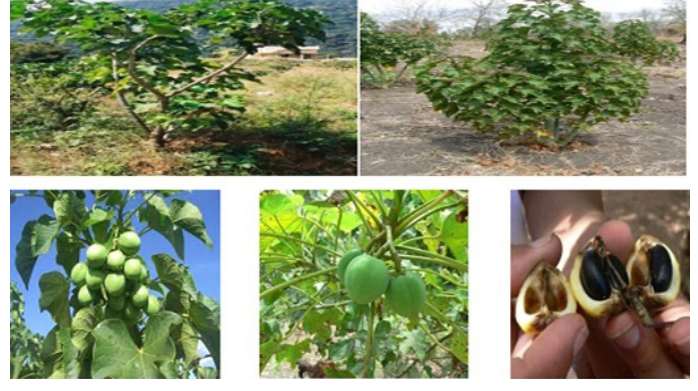
Figure 1: Jatropha seed plant.

reaction temperature, oil to methanol molar ratio, reaction time, mixing rpm, pH and composition of fatty acid in oil raw material. Oil was obtained from jatropha seed plant and purchased from Kh herbals which deal all kind of essential oil, herbal extracted and cold press oil from Lahore. The extracted oil have some dark brown colour. In this experiment NaoH used as a catalysts. NaoH was manufactured by duksan company and purchased from Khan associate Lahore. Methanol is used with oil in different molar ratio on specific reaction time. Three (3) gm NaoH used as a catalyst with 10ml of methanol in 100 ml jatropha oil