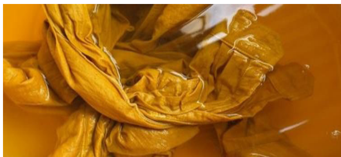
Figure 1: Sample dyeing from the extraction of turmeric.

This chapter deals with the results of turmeric dye on silk fabric on three concentration level through tables. The following is given the analysis of data as per sequence of objectives.