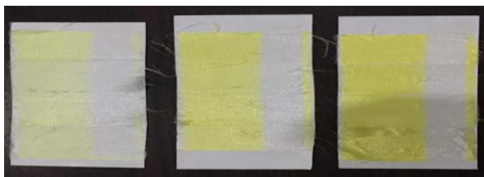
Figure 2: Concentration levels of turmeric dye.

Figure 1 shows the extraction of dye from turmeric powder in concentration level 1. Add 1 tablespoon of turmeric dye in 10ml water and boiled it for 10 minutes for color extraction. Same recipe was followed for level 2 with 2 tablespoons of turmeric and level 3 with 3 tablespoon of turmeric.