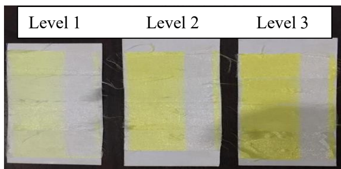
Figure 6: The three different concentration levels.

Specifies a method intended for determining the effect on the colour of textiles of all kinds and in all forms to the action of an artificial light source representative of natural daylight. Results in this table shows that light fastness remain same before and after 5, after 10, and after 15 washes in level 3.