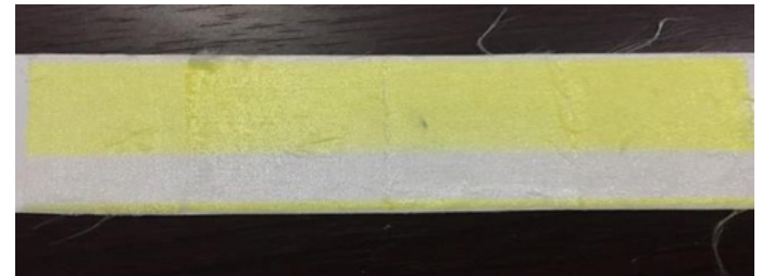
Figure 3: Machine wash for 15 minutes for each wash.

In level 2, 2 tablespoons of turmeric were used that show dark shade of yellow as compare to level 1. When in level 3 increase the quantity of turmeric to 3 tablespoons so it shows darker color of dye. Results in this table shows that light fastness remain same before and after 5, after 10, and after 15 washes in level 1.