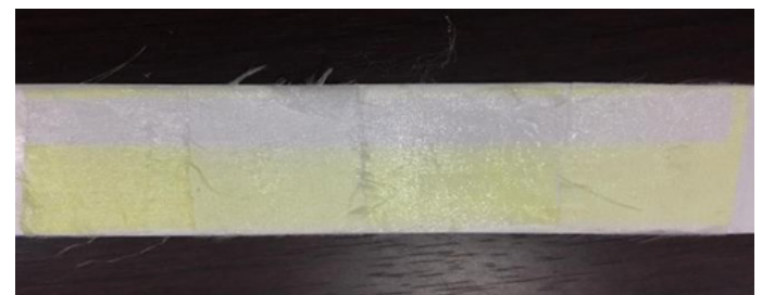
Figure 4: Machine wash for 15 minutes for each wash.