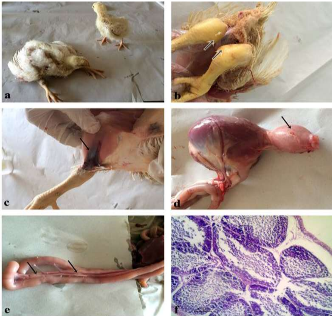
Fig. 1: Clinical signs and pathological lesions of avian reovirus infections in broiler chickens. (a) Broiler cases with stunting growth and arthritis at 4 weeks of age; (b) Broiler cases with bilateral arthritis and swelling of hock joints (Arrows); (c) Marked hemorrhages in the tendon and tendon sheaths (Arrow); (d) Enlarged proventriculus (Arrow); (e) Pale and dilated intestine with markedly atrophied pancreas (arrows); (f) Bursa of Fabricius follicles with moderate lymphocytic depletion.

Broilers that suffered from lameness (Fig. 1a) showed marked swelling in the hook joints (Fig. 1b). Birds showed severe tenosynovitis of the gastrocnemius tendon represented by hemorrhages and edema in tendon and the tendon sheath (Fig. 1c). Microscopically marked infiltrations of the tendon with lymphocytes, plasma cells, and few heterophils were observed. The proventriculus was distinctly dilated and enlarged (Fig. 1d) and showed lymphocytic infiltrates in the proventricular glands and in the lamina propria. The intestine was pale, dilated and filled with undigested feed (Fig. 1e); while microscopically the intestinal submucosa was infiltrated with lymphocytes, plasma cells and few heterophils. Marked atrophy of the pancreas was observed in most affected birds (Fig. 1e). Bursa of Fabricius was atrophied and showed lymphoid depletion of its follicles (Fig. 1f). Pericarditis lesions were also present in three affected birds.