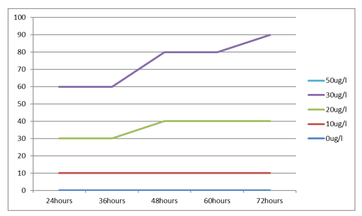
Figure 2: Death rate of of armyworm-Spodoptera exempta relative to Time of Application of the Concentrations of Heterorhabditis bacteriophora and its bacteria symbiont-Photorhabdus.

This study established that extracts of H. bacteriophora concentrates are detrimental to armyworm and the death rate of the armyworm is proportional to the concentration of the extract, and time of application. The study also revealed that the death rate of the armyworm is different for different concentrations, and for different length of time of application.