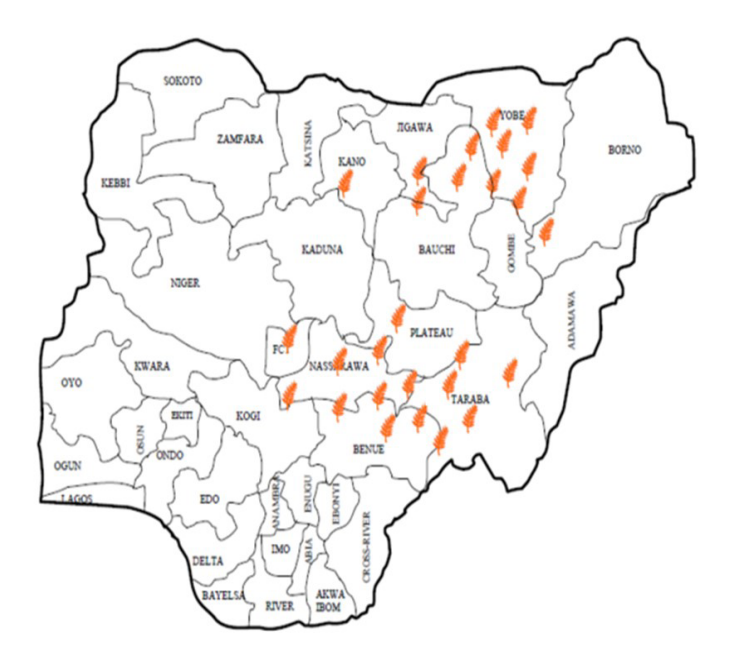
Figure 1: Map of Nigeria showing beniseed producing states.

The seeds, which yield half of their weight in oil, are most commonly used in soups, while the young leaves are used as a soup vegetable. Various parts of the plants are also used in native medicines. The stems are usually burned as fuel where firewood is scarce and the ash is commonly used for local soap production. The pressed cake remaining after the oil is removed which is a rich source of protein for farm animals (Falusi and Salako, 2001).