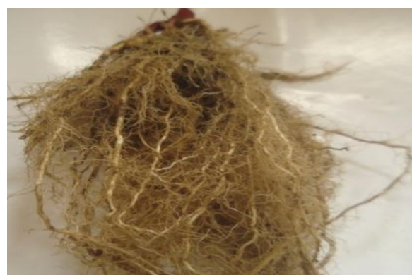
Fig. 1b. Obaatampa maize plant root inoculated with 2000 M. incognita eggs.