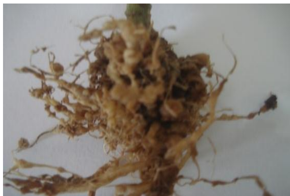
Fig. 1a. Asontem okra plant root inoculated with 2000 M. incognita eggs.

Each value is a mean of two pooled results of five replicates each; pi = Initial egg population, pf (nematode population per 100 cm 3 soil + 5 g root weight at harvest), R = Resistance, S = Susceptibility; (Rf< 1) = Low reproduction, (Rf> 1) = higher production (Oostenbrink, 1966)