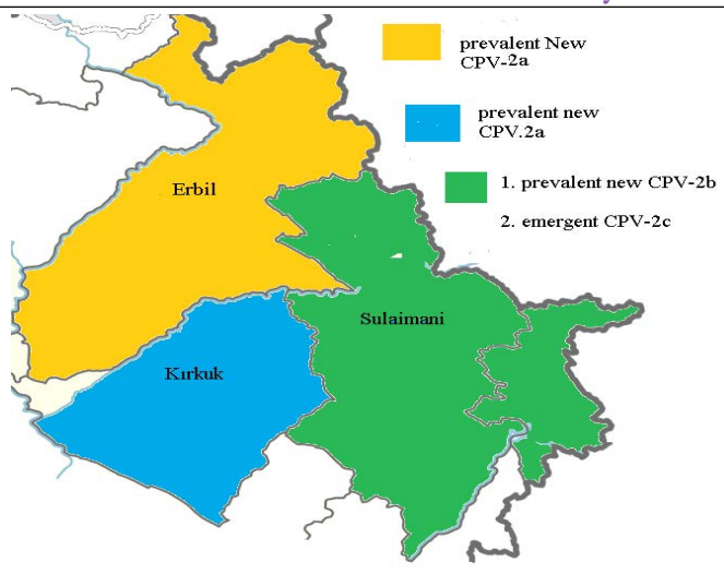
Figure 3: Geographical distribution of CPV-2 variants in three regions of Iraq. new CPv-2a in Erbil and Kirkuk, new CPV-2b and CPV-2c in Sulaimani.