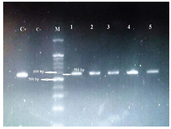
Figure 1: Specific fragment of the VP2 gene (583bp) was amplified with primer 555f/55r. Lane M DNA marker (100bp), Lane C+, positive control, Lane C-, Negative control; Lane 1-5 positive sample

used in the VP2 study. The amino acid residues at locations (Alanin-A<sup>297</sup>) instead of (Serine-S<sup>297</sup>), indicating that all 10 sequences 2a were new CPV-2a strains and 5 sequences 2b were new CPV-2b strains, as demonstrated in the geographical distribution (Figure 3).