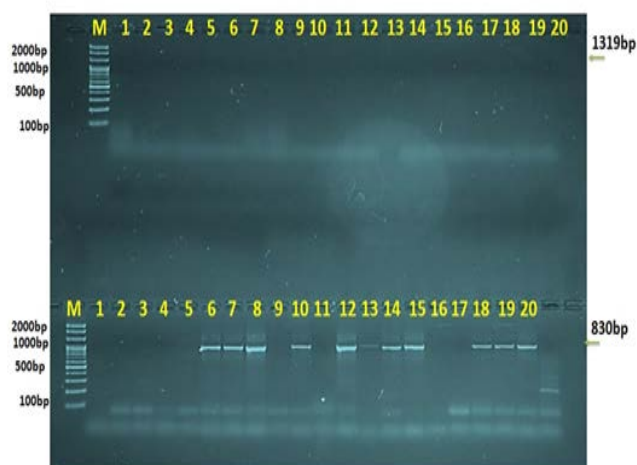
Figure 2: Agarose gel (1.5g/100 ml) electrophoreses of Cryptosporidium spp. genomic DNA image showed the PCR product analysis of a small subunit ribosomal RNA gene in Cryptosporidium spp. from a quails drop sample. Where M: marker (2000-100bp), lanes showed some positive Cryptosporidium spp. at (830 bp) PCR product.

The molecular diagnosis showed that the infection rate in quails was 37% (37/100), the samples were collected randomly from 100 quails in Baghdad city. All drop samples showed a unique 830 bp on agarose gel for Cryptosporidium spp. as shown in Figure (2).