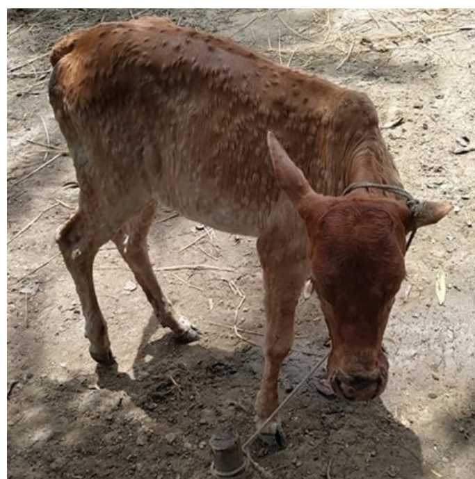
Figure 1: LSD in a calf (image was taken during an outbreak of LSD in 2019 at Pekua, Cox's Bazar, Bangladesh). The entire body was covered with multiple nodular skin lesions.