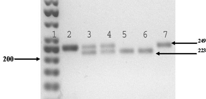
Figure 3 : Electrophoretogram of DNA typing of the bIGF-1 -SnaBI polymorphism (Kenny et al., 2011); Track 1 – molecular mass marker O'Range Ruler <sup>TM</sup> 50 bp DNA Ladder, Fermentas, Lithuania; track 2 – PCR product of the 249 p.n. fragment of the bIGF-1 -SnaBI gene; tracks 3 and 4 – fragments of the 249 and 223 p.n. restriction corresponding to the bIGF-1 -SnaBI<sup>AV</sup> genotype; tracks 5 and 6 – a fragment of the 223 p.n. restriction corresponding to the bIGF-1 -SnaBI<sup>AA</sup> genotype; and track 7 – a fragment of the 249 p.n. restriction corresponding to the bIGF-1 -SnaBI<sup>VV</sup> genotype. The fragment of 26 p.n. is not visualized. The positions of specific bands on the gel are shown by arrows. Electrophoresis was performed in 2 % agarose gel (SeaKem LE Agarose, Lonza, USA).

Polymorphism of the nucleotide sequence of the bGHbGHR gene in exon 8 was analyzed with the use of the SspI restrictase. The SspI restrictase recognizes the T \rightarrow A transition in exon 8. This SNP causes a substitution of the polar, although uncharged, tyrosine residue instead of neutral phenylalanine at protein position 279. The restrictase recognition site is the AAT \downarrow ATT sequence. The amplificate dissected with the enzyme contains nucleotide T corresponding to the bGHR-SspI ^F allele. In the presence