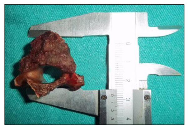
Figure 3: The appearance of foreign body (sheep vertebral bone) removed from oesophagus

bone had a considerable irregular surface with sharp edge. Interestingly, food transition was partially provided from vertebral channel that existed in the middle of the bone. Therefore, the animal could survive for four months without any therapy.