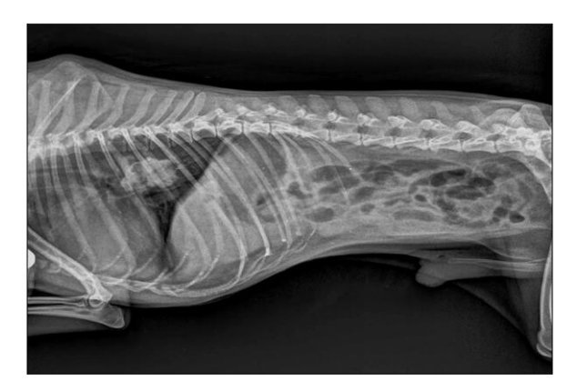
Figure 1: Lateral thoracic radiography of the case showing radiopaque density between heart base and diaphragm

The dog was positioned in right lateral recumbency, and a standard left intercostal thoracotomy was performed. The oesophagus was identified, and branches of the vagus nerve were gently retracted from the affected site. Non-absorbable sutures were placed on both sides of the oesophageal incision site to provide traction and stability during oesophageal manipulation. Saline–soaked sponges were packed around the proposed incision site to limit contamination of the pleura. A dorsal or left lateral longitudinal incision was made in the oesophagus overlying