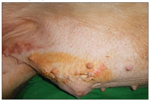
Figure7: Removal of skin suture after 10 days of complete healing

antimesenteric border to extract the fecoliths (Figure 3). Thereafter, the opening was closed by Continous Lembert's suture with 2/0 Chromic catgut (Figure 4). Subsequently, the herniated intestines were slowly reposed back with the help of blunt–end forceps and fingers avoiding any hemorrhage and over–manipulation to prevent any complications. Herniorrhaphy was done using black braided silk in simple interrupted pattern after the ring was freshened (Figure 5) and the muscles and skin closed in usual manner (Figure 6). Post–surgically, antibiotics (Inj.