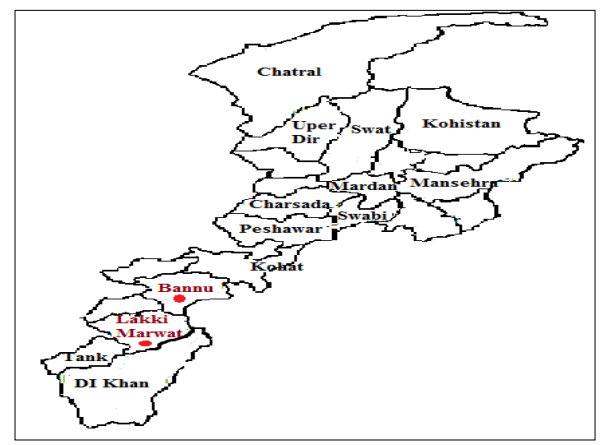
Figure 1: Map of Khyber PakhtunKhwa province showing the study area (Highlighted Red)

The study was conducted on the lactating dairy cattle in District Bannu and Lakki Marwat, Khyber PakhtunKhwa Pakistan, from May to July, 2011(Figure 1).