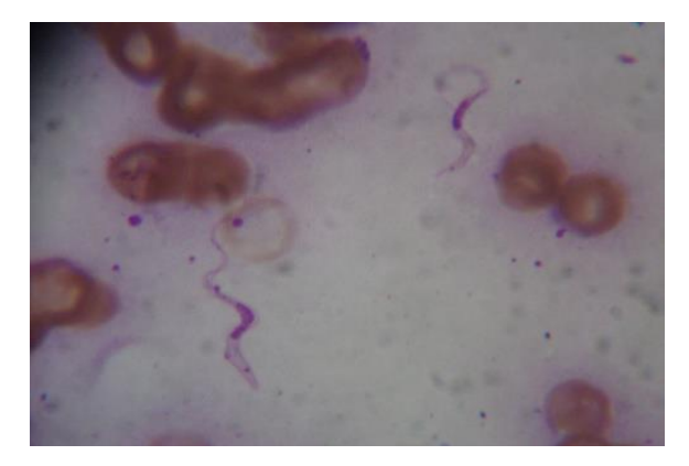
Figure 3: Trypanosoma evansi in stained smears (100 X with 4x camera magnification)

Isolate of T. evansi collected from the field case was maintained in the Wistar rats for bulk harvest of parasites. At the high of parasitaemia in rats, the rats were bled by heart puncture and the blood was collected and used for separation and purification of Trypanosoma evansi by using DE AE (Diethyl amino-ethyl cellulose anionexchange column chromatography).Whole cell lysate (WCL) antigen was prepared from purified trypanosomes. Protein concentration of the WCL Ag of T. evansi prepared in the present study was estimated as per Lowry et al. (1951) and it was adjusted to 1.0 mg/ml in PBS, pH 8.0 and stored at -20^{\circ} C in 1.0 ml aliquots. The hyper immune sera (HIS) was raised in two healthy New Zealand white rabbits, raised against WCL Ag was confirmed by agar gel precipitation test and counter immune electrophoresis. Pre immunized serum of these experimental rabbits was also stored at -20°c till use as negative control serum for standardization of Indirect ELISA (Sivajothi et al., 2014a).