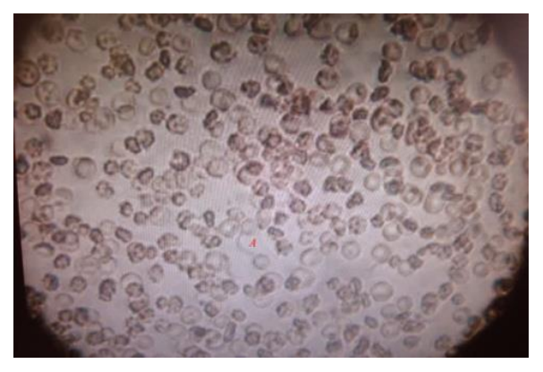
Figure 2: Trypanosoma evansi in wet blood smears (10 X with 2x camera magnification) (A-Live Trypanosoma evansi)

Wet blood film examination was done by placing a droplet of blood on a clean microscope slide and covering with a cover slip (22 × 22 mm). The blood is examined microscopically (400×) total magnification at approximately 50-100 fields per slide. A drop of blood was taken in the center on one end of a clean glass slide for smear preparation as suggested by Benjamin (Benjamin 1986). The blood smears were prepared and dried by waving in the air. The blood smears were fixed in absolute methyl alcohol for 3 min and stained with Giemsa's stain method of staining as described by Benjamin (Benjamin 1986). A drop of cedar wood oil was placed on the stained smear and the slide was examined under the oil immersion lens (1000×) of the microscope for the presence of Trypanosoma evansi. Approximately 50-100 fields of the stained thin smear are examined, before the specimen was considered to be