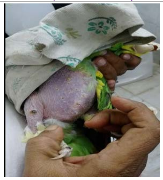
Figure 1: Amazon Parrot- Avian Pox-wart like lesions on the right thigh, breast and toes

The bird was found to be dull, inactive and weak. On physical examination, numerous wart like lesions measuring 1-3 mm in diameter were present scattered on the breast, thigh and the toes (Figure 1). Examination of these lesions using PCR confirmed the presence of Avipox virus. PCR targeting p4b gene revealed that all the three samples viz cutaneous lesions from the breast, toes and thigh were positive for Avipox virus (Figure 2). The droppings were yellowish in colour and watery in consistency which on microscopic examination revealed no endoparasitic larvae or eggs. The bird became active with normal feeding habits after ten days of treatment.