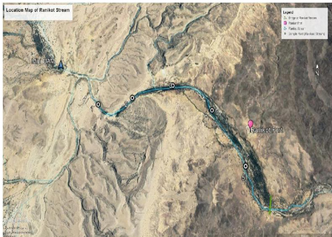
Supplementary Fig. 1. Collection sites of Ranikot steam.

3 Directorate of Fisheries, Gilgit Baltistan