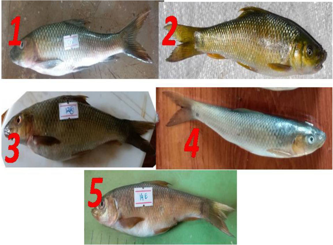
Supplementary Fig. 2. Five cyprinidae fish species, used for LWR, collected from Ranikoat stream-Sindh. 1, Labeo bata ; 2, L. pangusia ; 3, L. barbus ; 4, L. potail , and 5, L. porcellus .